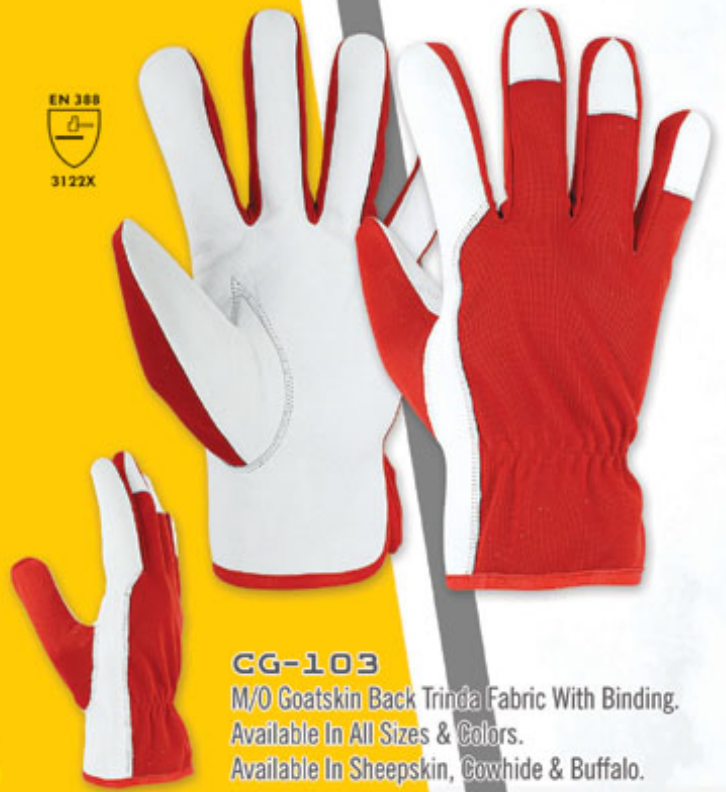
CG-103 M/O Goatskin Back Trinda Fabric With Binding. Available In All Sizes & Colors. Available In Sheepskin, Cowhide & Buffalo.