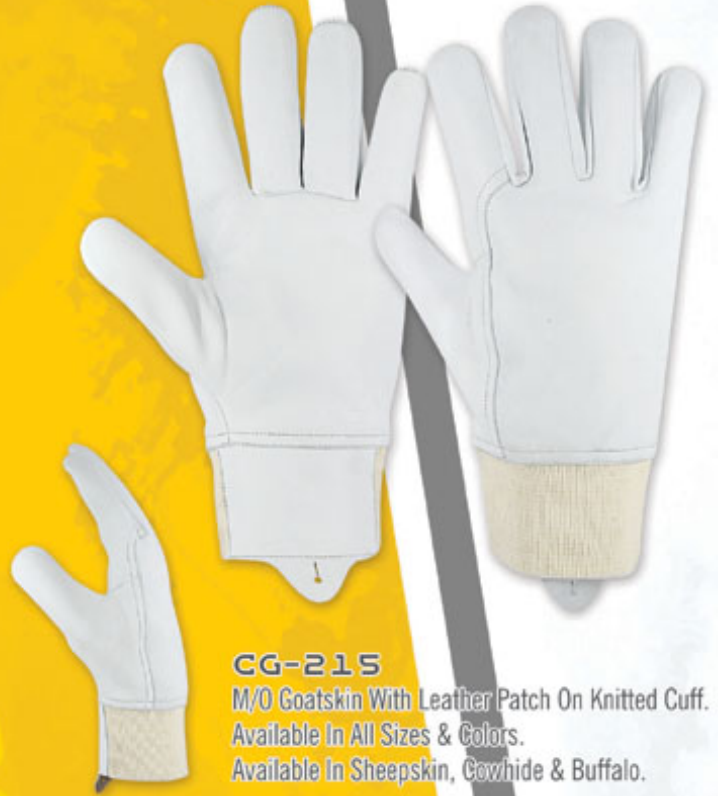
CG-215 M/O Goatskin With Leather Patch On Knitted Cuff. Available In All Sizes & Colors. Available In Sheepskin, Cowhide & Buffalo.