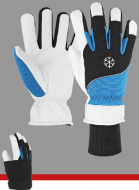
CG-610W M/O Goatskin Back Fourway Fabric Reflector Piping Mesh Fabric Between Fingers With Knitted Cuff Inside Full Fleece Lining. Available In All Sizes & Colors. Available In Sheepskin, Cowhide & Buffalo.