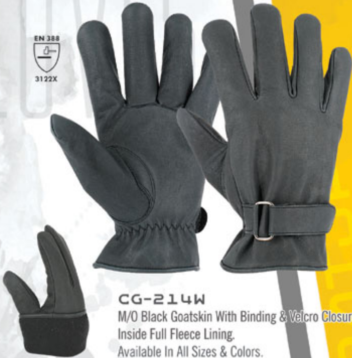
CG-214W M/O Black Goatskin With Binding & Velcro Closure Inside Full Fleece Lining. Available In All Sizes & Colors. Available In Sheepskin, Cowhide & Buffalo.