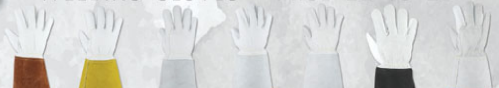
CG-402 CG-403 CG-404 CG-405 CG-405B CG-406 CG-407