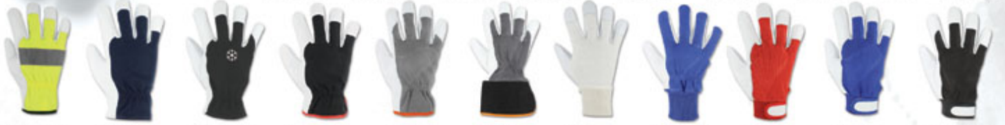
CG-107D CG-108U CG-108UB CG-109H CG-110 CG-111 CG-112 CG-113W CG-114 CG-115 CG-115B