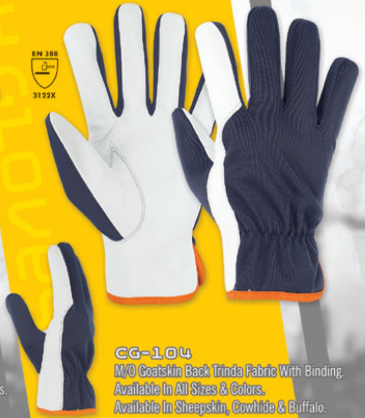
CG-104 M/O Goatskin Back Trinda Fabric With Binding. Available In All Sizes & Colors. Available In Sheepskin, Cowhide & Buffalo.