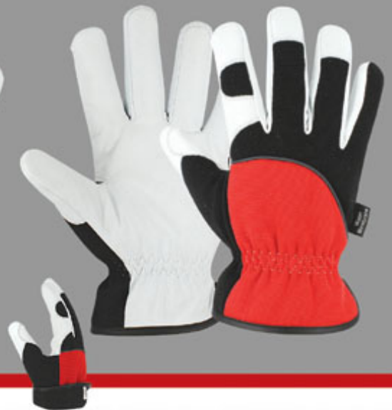
CG-612W M/O Goatskin Back Fourway Fabric With Reflector Piping & PU Binding Inside Micro Fleece Lining 40 Gram Thinsulate™ Lining With Wind Proof & Breathable Water-Membrane. Available In All Sizes & Colors. Available In Sheepskin, Cowhide & Buffalo.