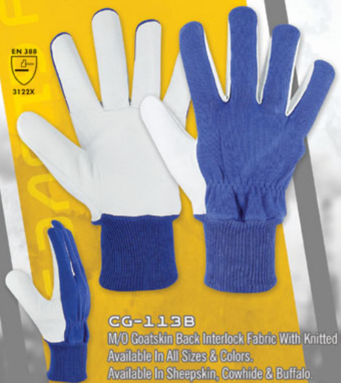
CG-113B M/O Goatskin Back Interlock Fabric With Knitted Cuff. Available In All Sizes & Colors. Available In Sheepskin, Cowhide & Buffalo.