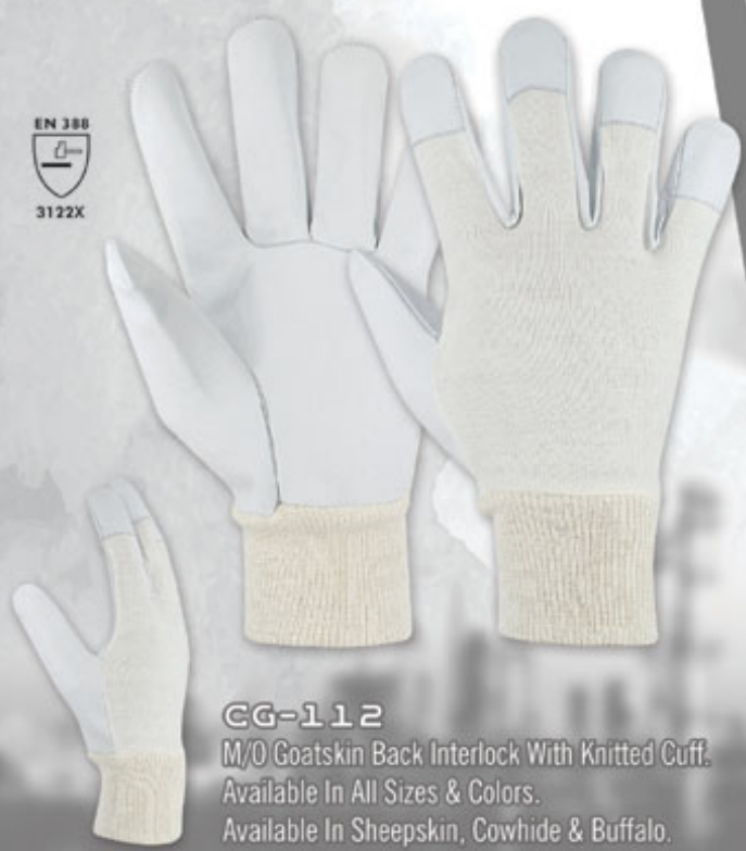
CG-112 M/O Goatskin Back Interlock With Knitted Cuff. Available In All Sizes & Colors. Available In Sheepskin, Cowhide & Buffalo.