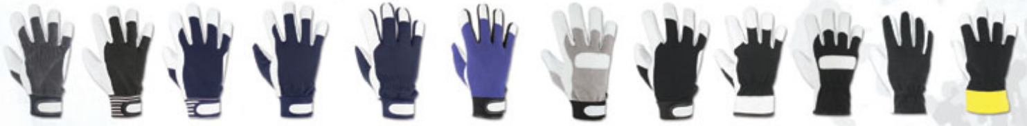
CG-116 CG-117 CG-118 CG-119 CG-120W CG-121 CG-122 CG-123 CG-124 CG-125W CG-126 CG-127