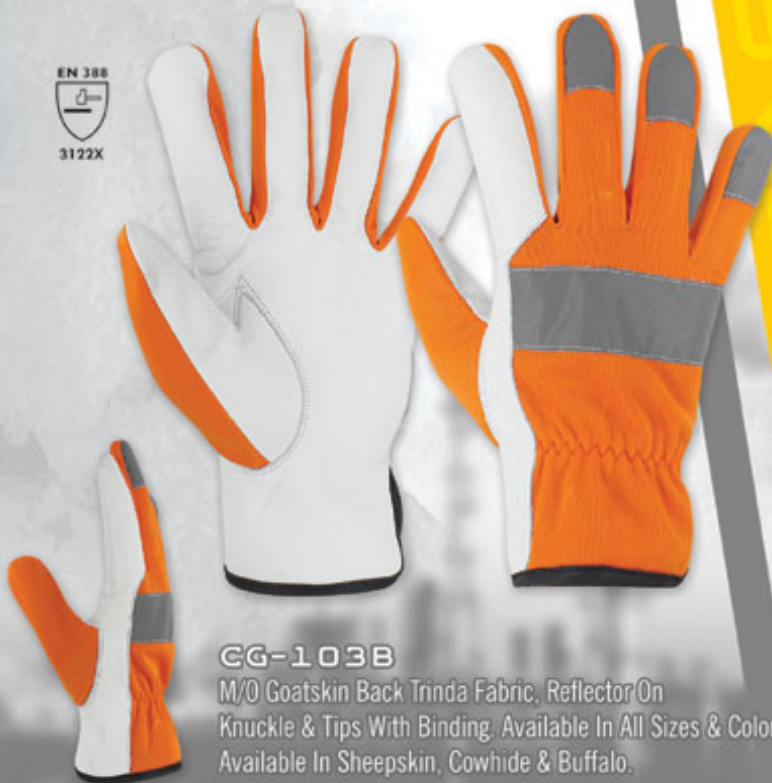
CG-103B M/O Goatskin Back Trinda Fabric, Reflector On Knuckle & Tips With Binding. Available In All Sizes & Colors. Available In Sheepskin, Cowhide & Buffalo.