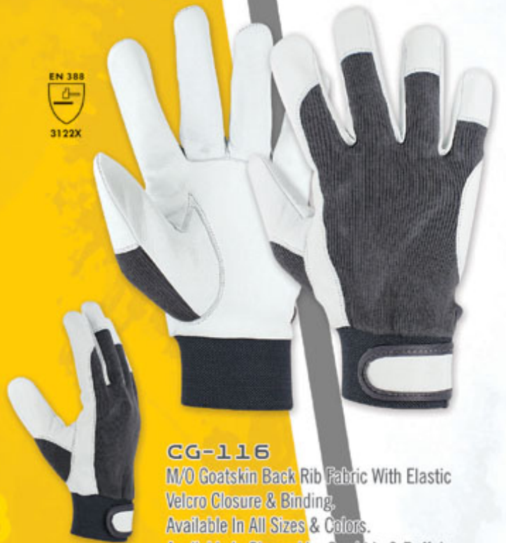
CG-116 M/O Goatskin Back Rib Fabric With Elastic Velcro Closure & Binding. Available In All Sizes & Colors. Available In Sheepskin, Cowhide & Buffalo.