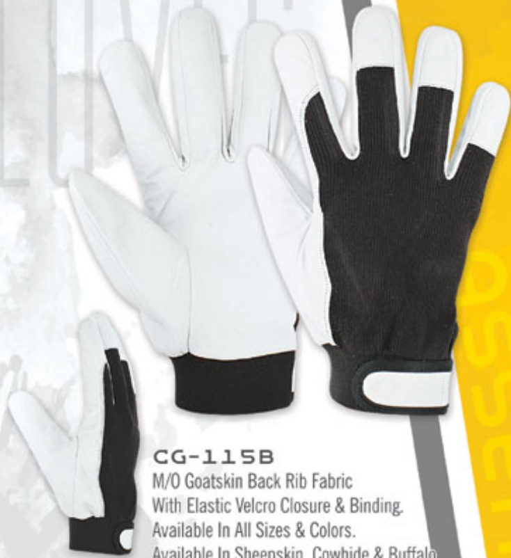
CG-115B M/O Goatskin Back Rib Fabric With Elastic Velcro Closure & Binding. Available In All Sizes & Colors. Available In Sheepskin, Cowhide & Buffalo