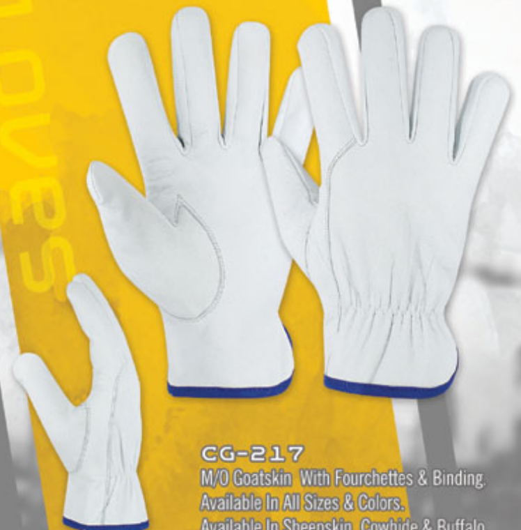
CG-217 M/O Goatskin With Fourchettes & Binding. Available In All Sizes & Colors. Available In Sheepskin, Cowhide & Buffalo.