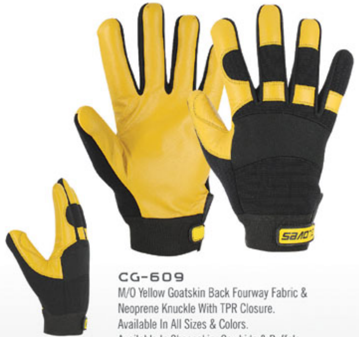
CG-609 M/O Yellow Goatskin Back Fourway Fabric & Neoprene Knuckle With TPR Closure. Available In All Sizes & Colors. Available In Sheepskin, Cowhide & Buffalo.