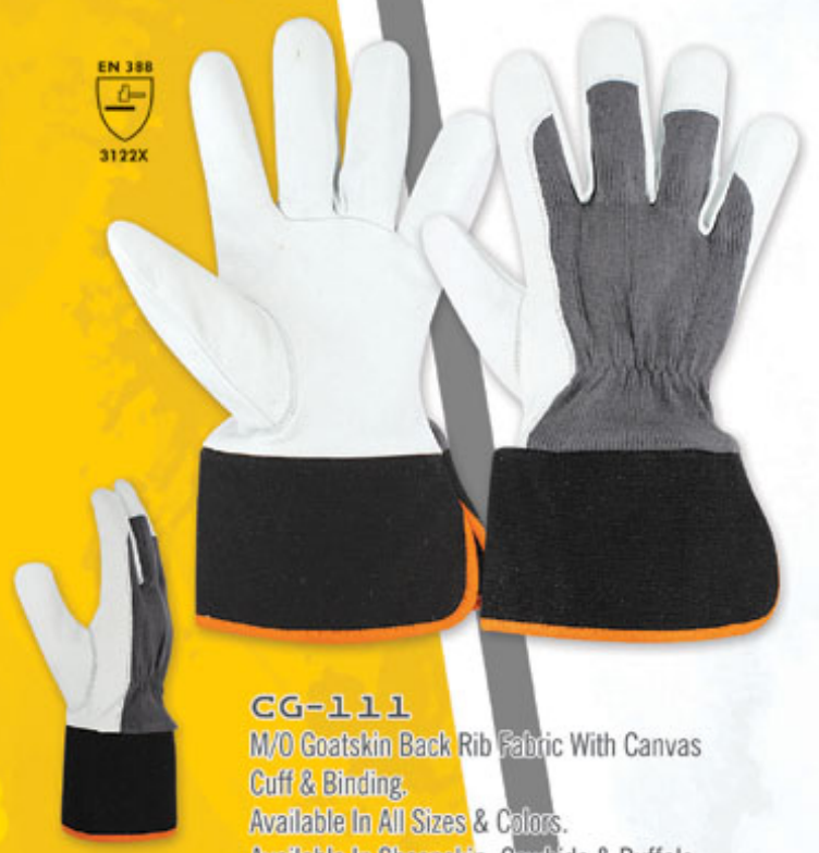
CG-111 M/O Goatskin Back Rib Fabric With Canvas Cuff & Binding. Available In All Sizes & Colors. Available In Sheepskin, Cowhide & Buffalo.