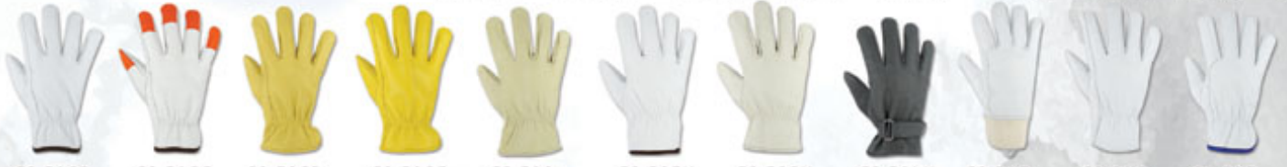
CG-210B CG-210C CG-210D CG-210E CG-211 CG-212H CG-213H CG-214H CG-215 CG-216 CG-217