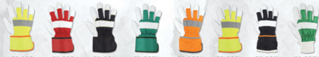
CG-302 CG-303 CG-304 CG-305W CG-306W CG-307W CG-308W CG-309W