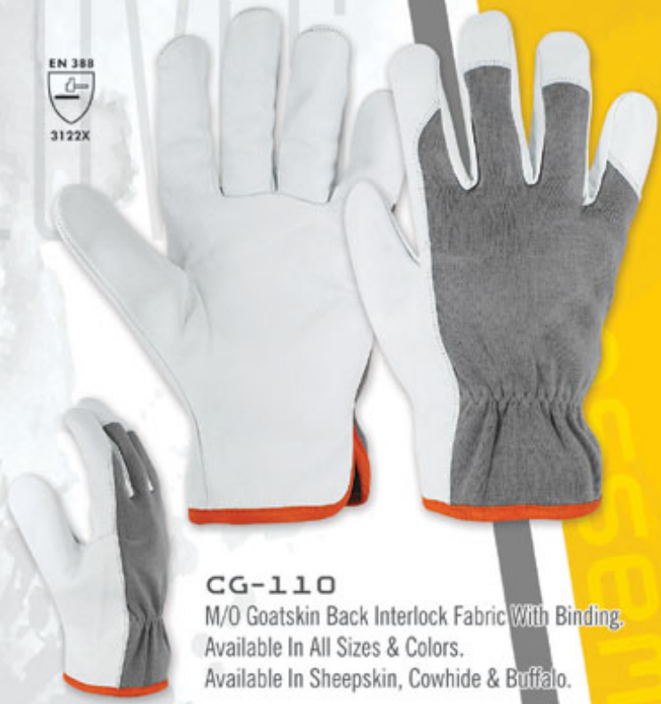
CG-110 M/O Goatskin Back Interlock Fabric With Binding. Available In All Sizes & Colors. Available In Sheepskin, Cowhide & Buffalo.