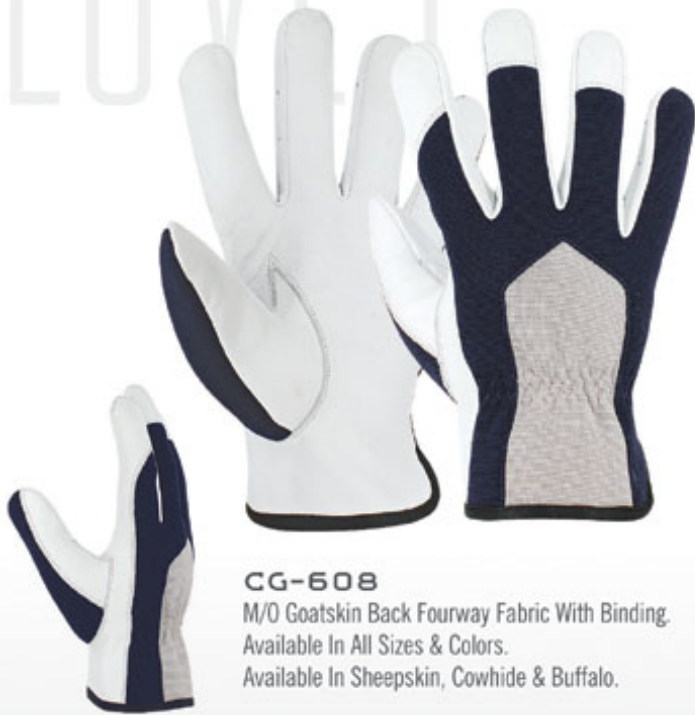
CG-608 M/O Goatskin Back Fourway Fabric With Binding. Available In All Sizes & Colors. Available In Sheepskin, Cowhide & Buffalo.