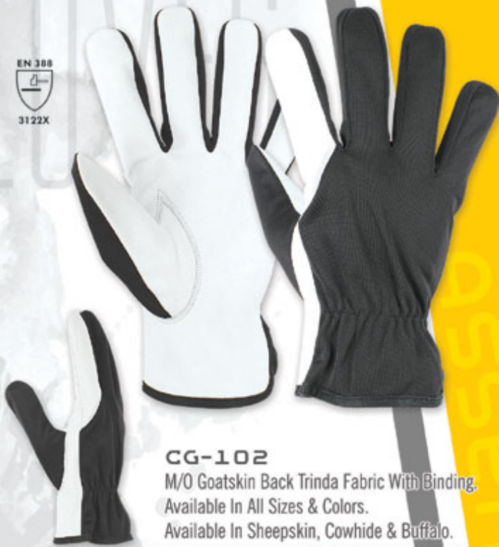
CG-102 M/O Goatskin Back Trinda Fabric With Binding. Available In All Sizes & Colors. Available In Sheepskin, Cowhide & Buffalo.