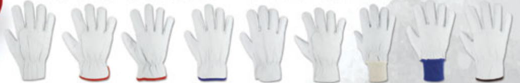
CG-202 CG-203H CG-204 CG-205 CG-206 CG-207 CG-208 CG-209 CG-210