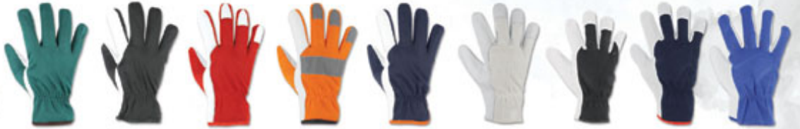
CG-101B CG-102 CG-103 CG-103B CG-104 CG-105 CG-106 CG-107 CG-107B