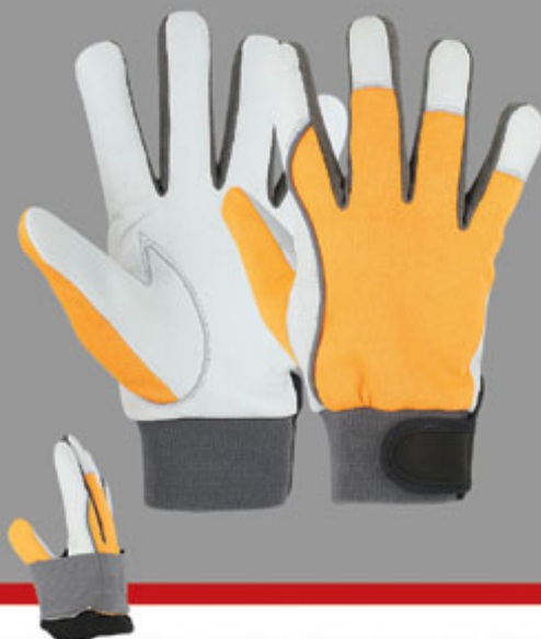
CG-611W M/O Goatskin Back & Between Fingers Speedo Fabric With Reflector Piping, Elastic & TPR Velcro Closure Inside Full Fleece Lining. Available In All Sizes & Colors. Available In Sheepskin, Cowhide & Buffalo.