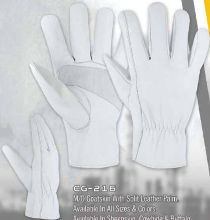
CG-216 M/O Goatskin With Split Leather Palm. Available In All Sizes & Colors. Available In Sheepskin, Cowhide & Buffalo.